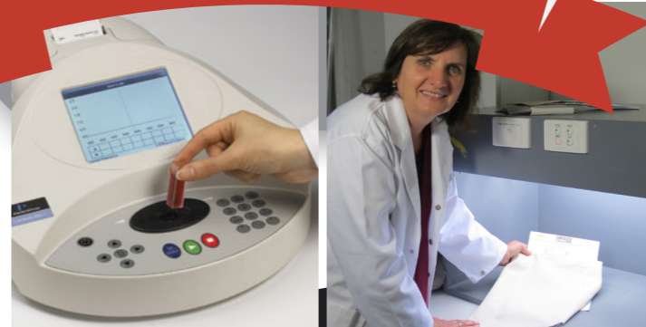
This spectrophotometer measures chromatic intensity through wavelengths